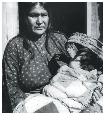
A Hopi mother holding her baby in a cradleboard (c.1905-1912). The baby is wrapped in a patchwork quilt.

Textile work among Hopi began as a practical pursuit – the male role of farming and growing cotton extended from planting through processing. (Think of spinning, weaving and stitching as historic equivalent of ESPN on cold winter nights!) With the introduction of sheep from the Spanish in the 1600's, Hopi men began using wool and branched into knitting. Missionaries, though, are to blame for patchwork. Their creative challenge in the 1880's was simply bringing the Hopi into church. They