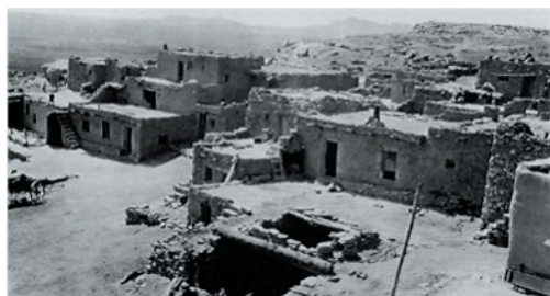
Oraibi Village, 1923.