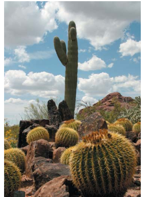
BarrelCactus, credited to Charles Cobeen. Each photograph/image is copyrighted and the sole property of the Desert Botanical Garden.